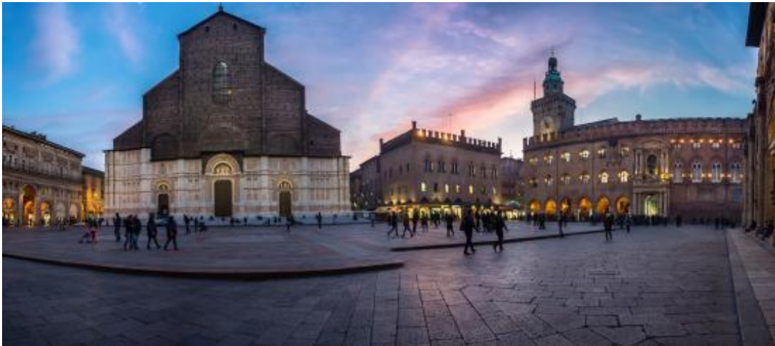
Bologna, Piazza Maggiore

Hoping to see you soon, just a small preview of the city: